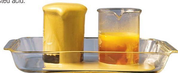
Competitive Product with Dangerous Foam

To demonstrate its capability as a low-foam product, Liquid Scale Dissolver was added to a beaker containing lime scale. A leading competitive hydrochloric acid based product was added to another beaker containing an equal amount of lime scale. The difference is dramatic. When cleaning towers and evap condensers, low-foam is the preferred approach as high foam is both dangerous to personnel and surroundings and it represents wasted acid.