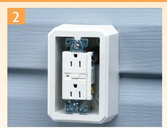
Mount box to siding and install your choice of either a GFCI, switch or duplex receptacle.

Complete installation with one of Arlington's code required extra-duty weatherproof while-in-use 60 Series or 61 Series Low Profile IN-AND-OUT™ covers. See Page K-16 for more information.