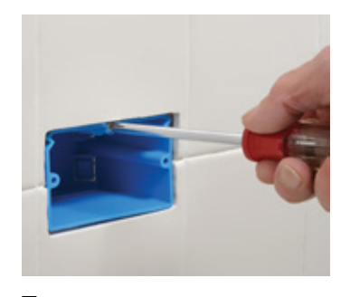
02 Turn the Adjust-A-Box screw after installation to bring the box flush with the wall surface.

Adjustability for different wall thickness with the simple turn of a screw has made the Carlon Adjust-A-Box line a favorite of electrical installers everywhere.