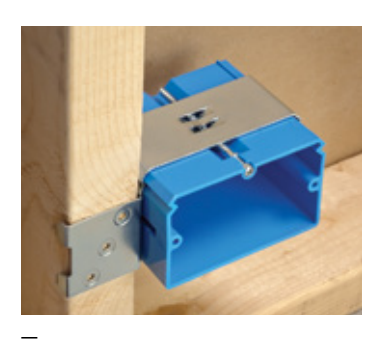
01 Clip the Adjust-A-Box metal bracket onto the stud for square, secure mounting.