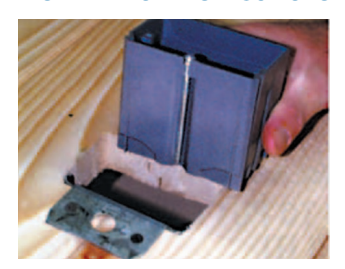
Install clip over subfloor.