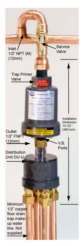
NOTE: Consult plumbing inspector prior to installing distribution units.